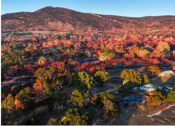
Pomonal on 26 April 2024