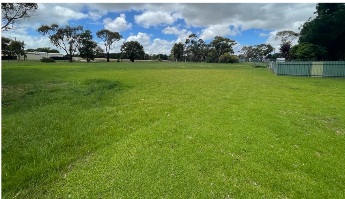
Image 5 (above). Lake Bolac Recreation Reserve, land next door to the kindergarten, January 2024.