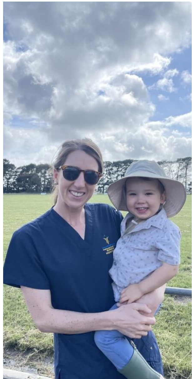
Image 4 (above). Access to childcare would enable, and help attract and retain, key workers to the Lake Bolac region.

This project undertook a series of investigations to determine viable models of early childhood education and care for the Lake Bolac and surrounding communities. These are summarized in Table 2 below.