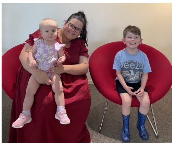
Image 2 (left). Many young families have moved into the Lake Bolac region and would like to be able to access childcare locally.